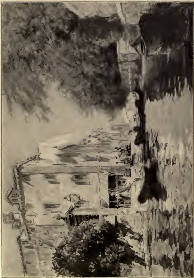
I have laid hands on a canal—the Rio Giuseppe.